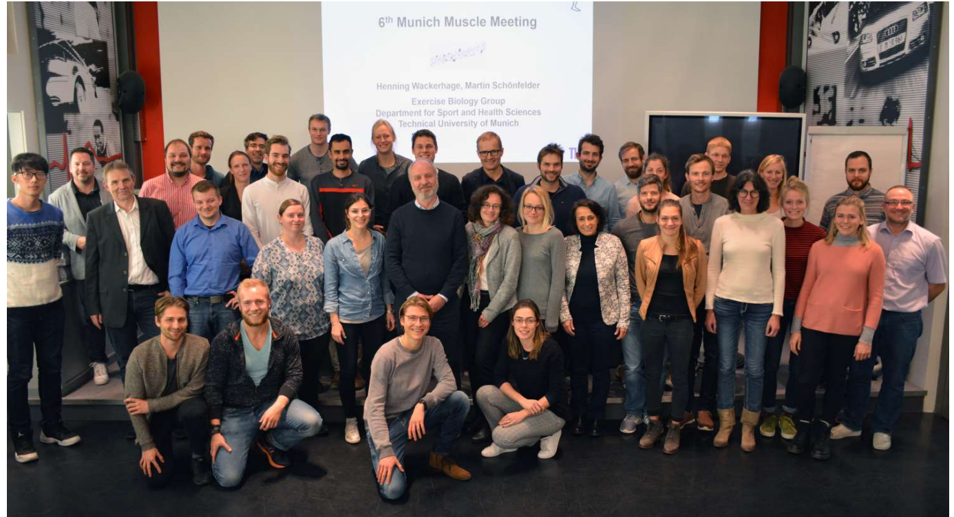
The Munich Muscle Meeting Group at the last meeting.