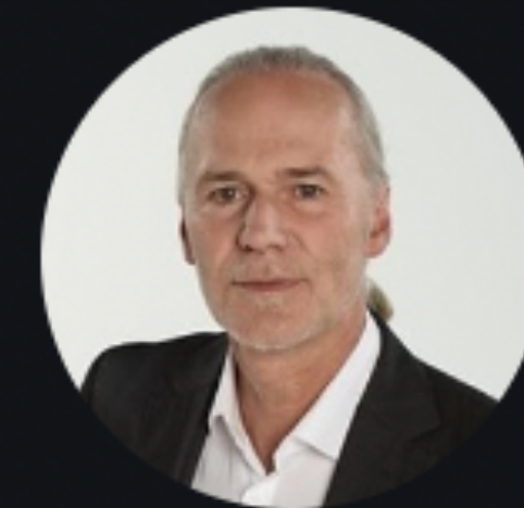
CONNECT2025 Congress President

University of South Florida founding Director of the Spaulding National Running Center at the Harvard Medical School